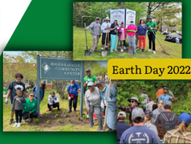
Earth Day 2022