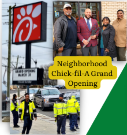
Neighborhood Chick-fil-A Grand Opening

(202) 838-6058—phone | https://lrcadc.org —website | Questions OR Comments—ask@lrcadc.org