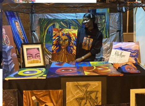
The Parks Main Street—Art All Night